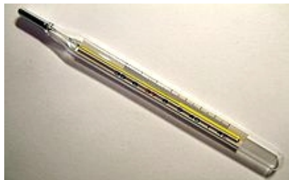
A medical/clinical thermometer showing the temperature of 38.7 °C

Taking a patient's temperature is an initial part of a full clinical examination. Sites used for measurement include: